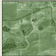
Hendry Site Florida