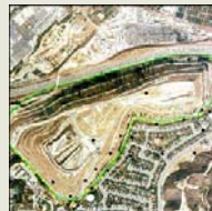
Operating Industries, Inc. California