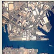
Iwilei Site Honolulu, Hawaii