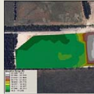
PAB Oil & Chemical Service, Inc. Louisiana