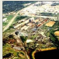
Tex Tin Site Texas