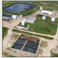
Malone Superfund Site Texas